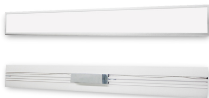
LED Continuous Panel Light - EFX-SHPLP50WCR

LED Continuous Panel Light - EFX-SHPLP50WCR Eco-FX LED Panel Light has super bright LED light source, which is stable and has no UV & IR emission.