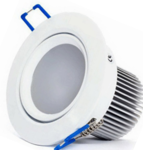
LED Downlight - EFX-GLDL10W (Frosted)