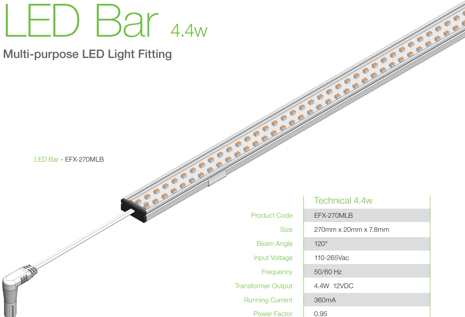
LED Bar - EFX-270MLB