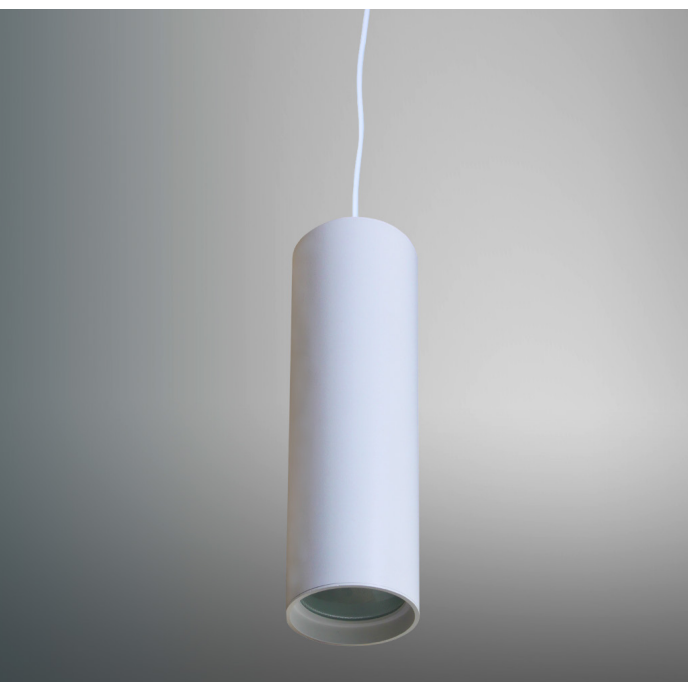
LED Pendant - EFX-RPLK10W