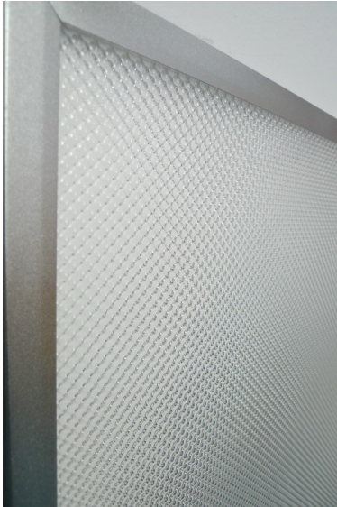
LED Panel Light - EFX-SHLP40W