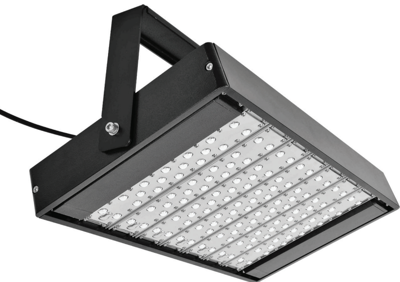
LED High Bay - EFX-AGHB210W