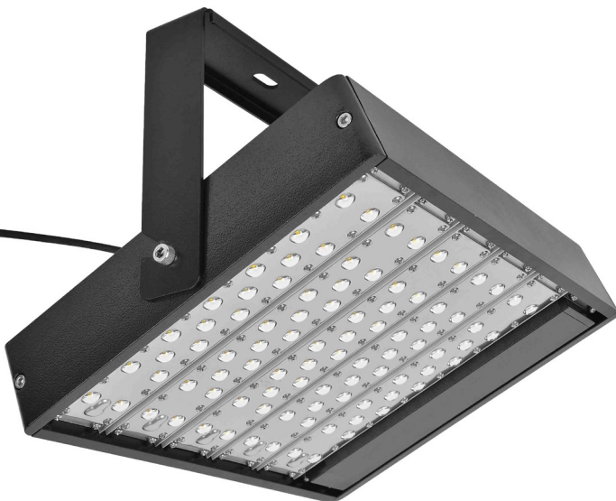
LED High Bay - EFX-AGHB150W