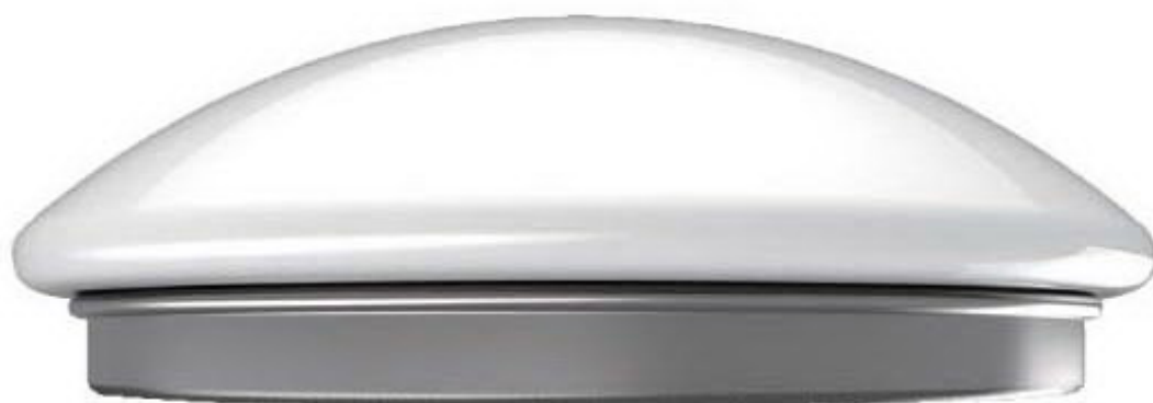
LED Circular 400mm - EFX-GLO420W