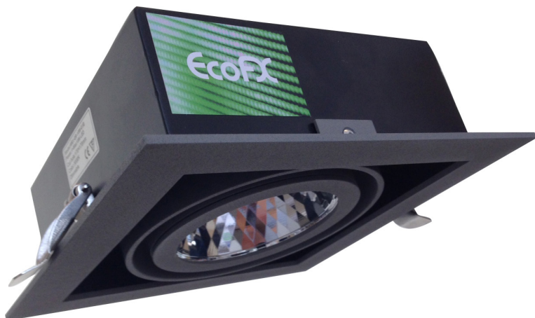
LED Downlight - EFX-MSDLA10W(L)