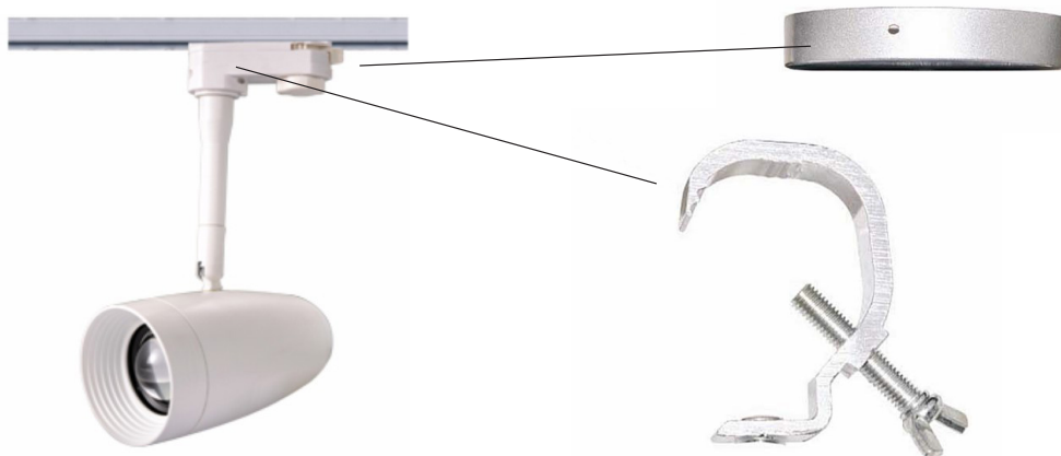
LED Track Light - EFX-SDS033K