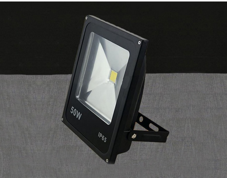
LED Floodlight – EFX-XTLFL50W