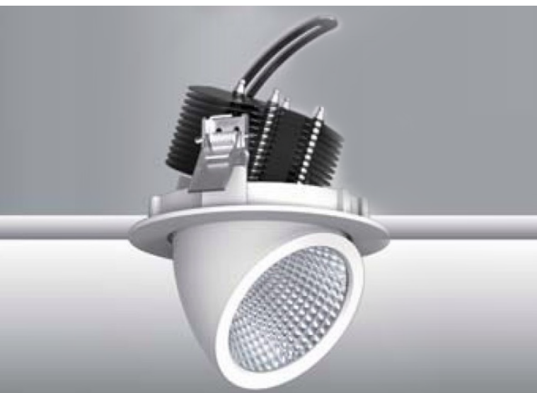
Gimbal LED Downlight – EFX-RGDL30W