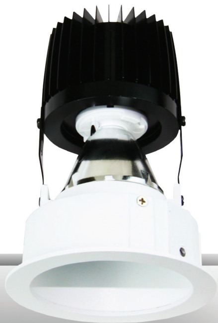
LED Downlight - EFX-RAMDL5W