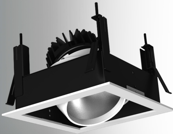
LED Downlight - EFX-RSDLA5W